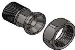
THREAD ON 1/2" MNPT